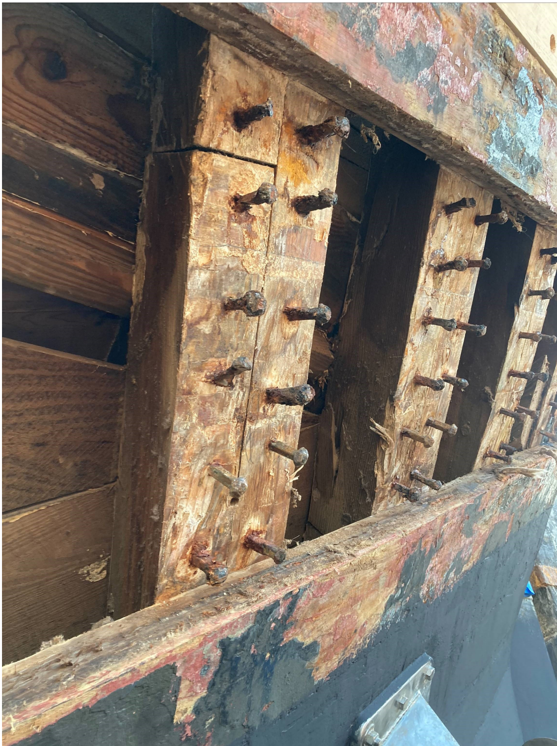
VIEW OF FRAMING WITH PLANKS REMOVED AFT PORT