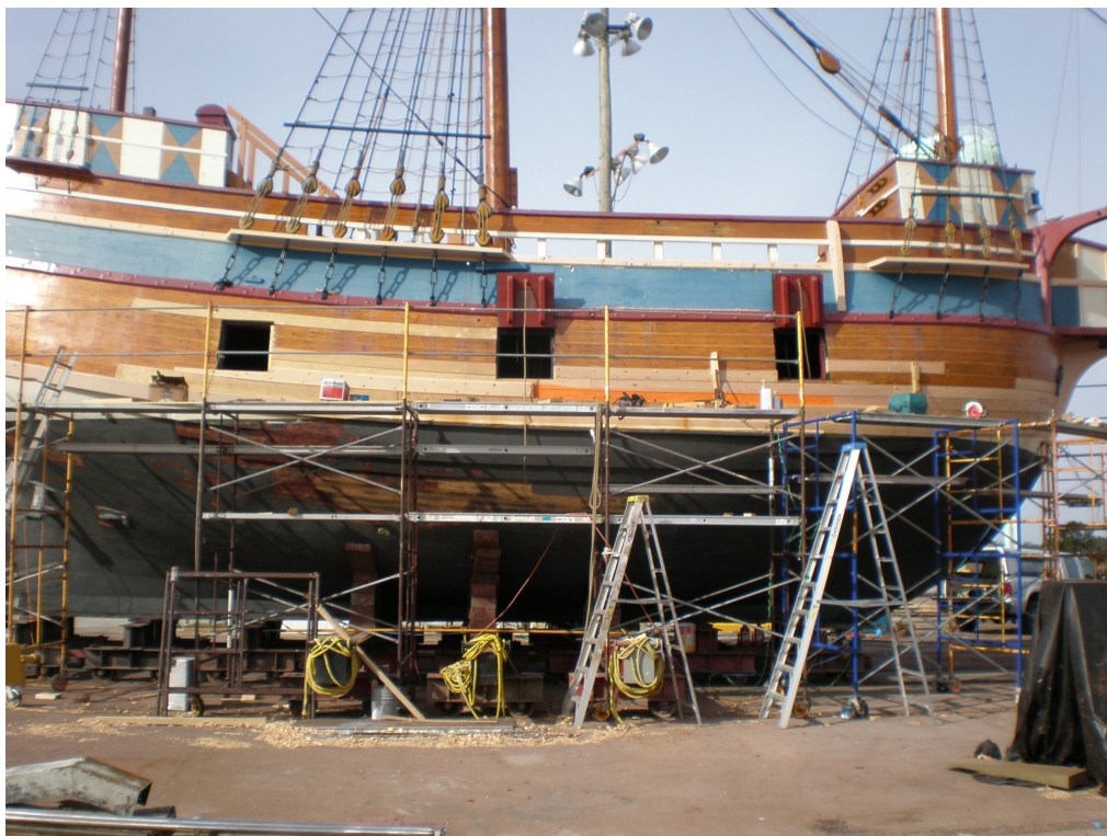
PARK PHOTO STARBOARD SIDE – 2016