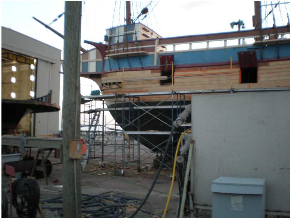
PARK PHOTO OF THE PORT SIDE PLANKING – 2016