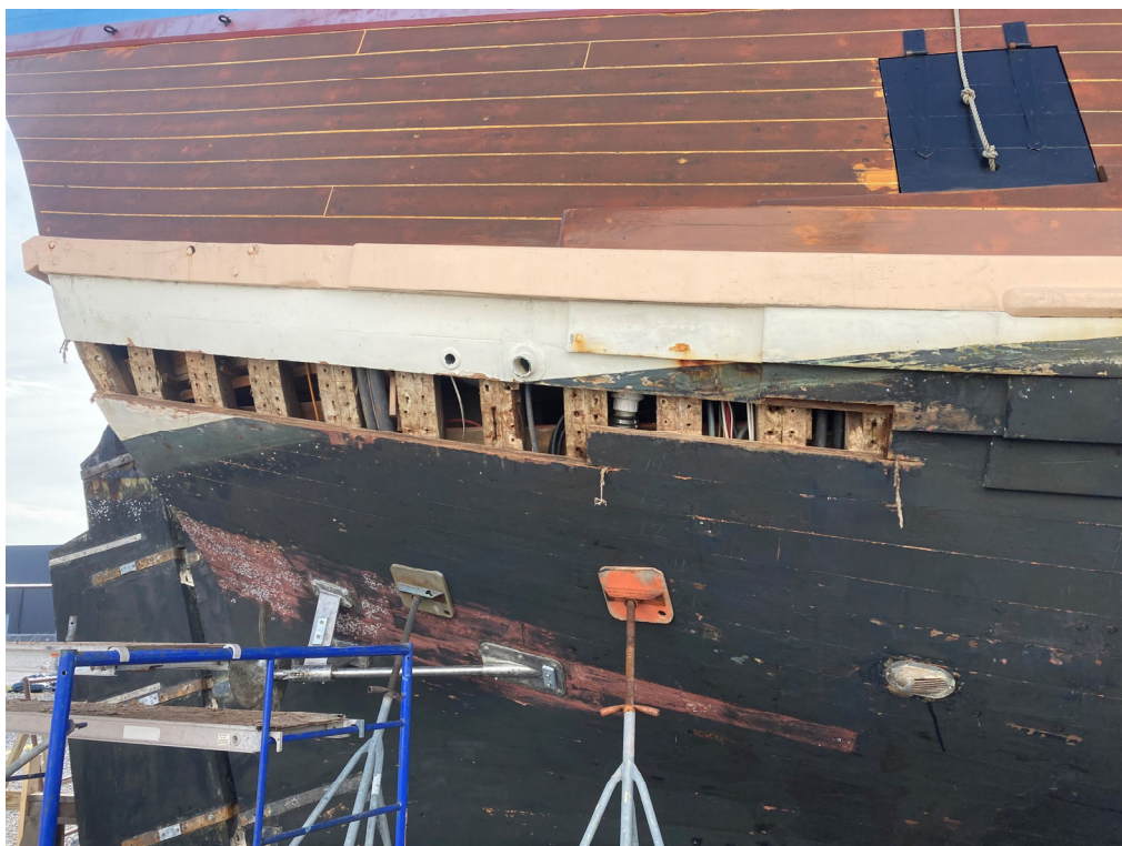
FORWARD AREA WHERE PLANKS WERE REMOVED – ALEX HADDEN PHOTO 2021