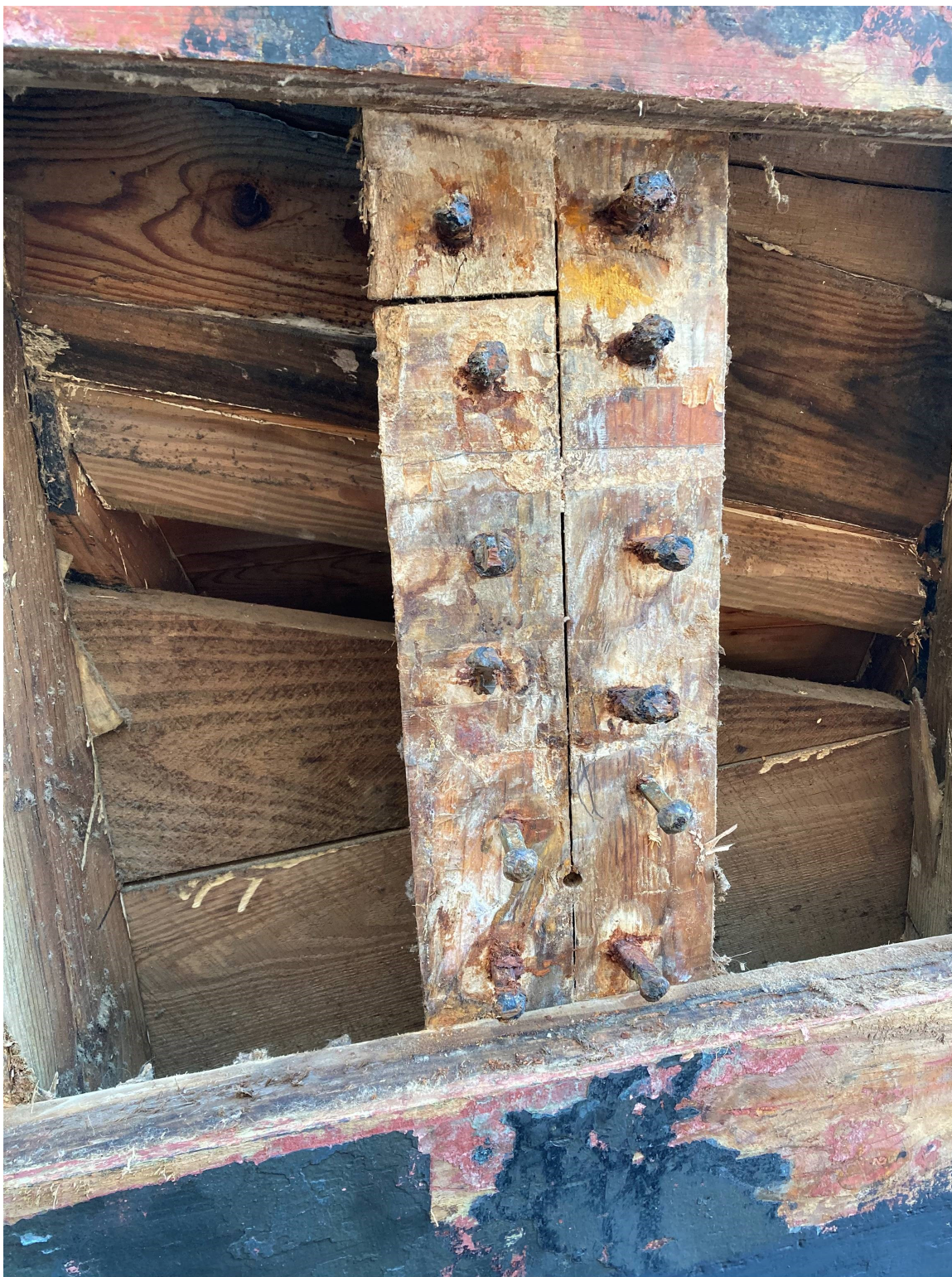
VIEW OF ANOTHER FRAME ON BOTH THE ABOVE PHOTOS NOTE THE GOOD CONDITION OF THE FASTENINGS