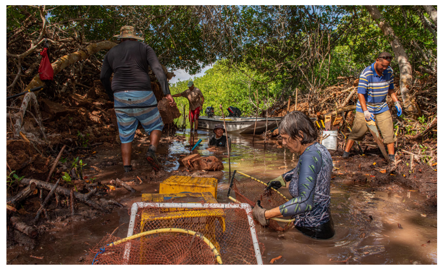
(Volunteers working in the mangroves, Lac Bay, Bonaire).