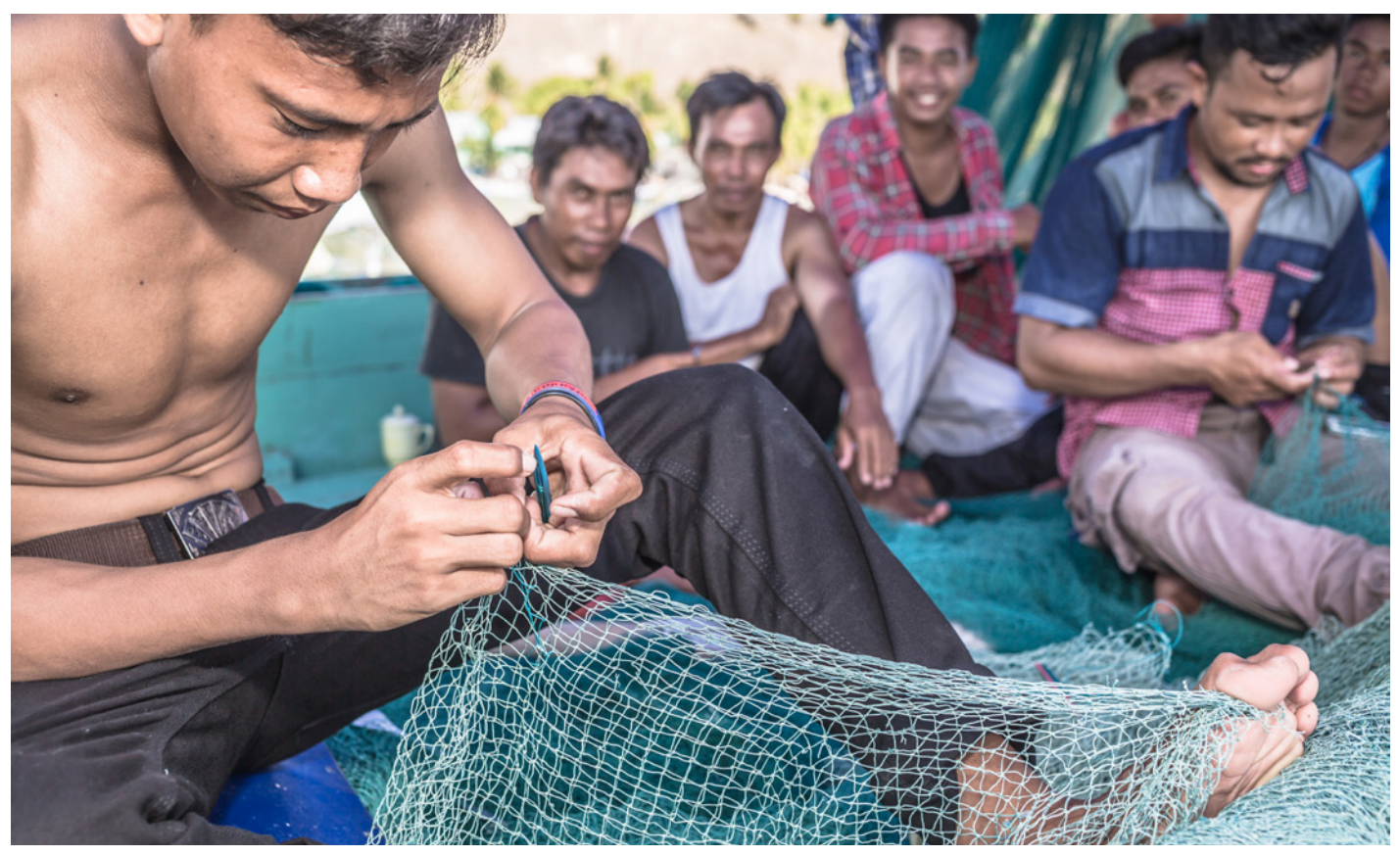
(Fisherman prepare traditional nets, Indonesia).

flooding tied to sea level rise and storm surges. Sustained ocean observations are critical to these efforts that require reliable, long-term funding sources and global coordination.