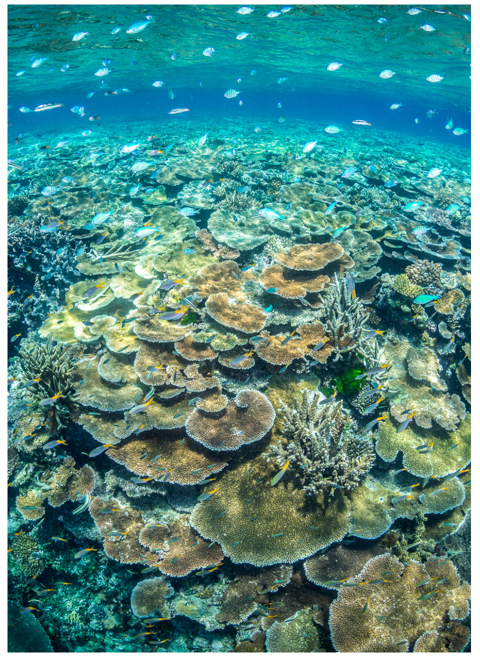
(John Brewer Reef, Great Barrier Reef, Australia).

The SUPREME programme seeks to globally implement an infrastructure to support robust climate- and ocean-related forecasts, predictions, and projections to guide marine ecosystem management and adaptation strategies that reduce risks and increase resilience of marine/coastal resources and the people who depend on them.