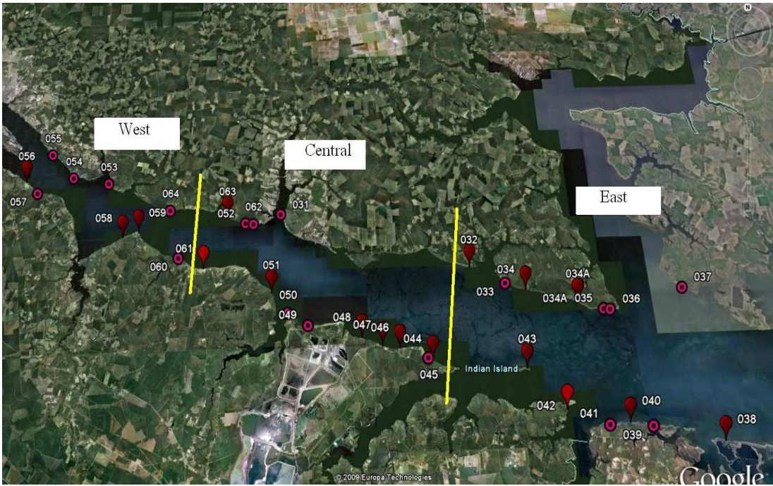
Figure A2. Adapted from Powers 2012. The 65 km study site of the Pamlico River from the Fork Point Island to the mouth of the Pungo River, North Carolina and the three sections West, Central and East and all 36 sub-sites. Red marks represented potential sites not selected by the random number generator, and pink circles (six stations within each section) represent sites that were included in the study.